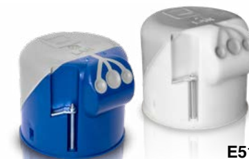
E5100 Art. No. 7360051