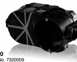
E550 Art. No. 7320009