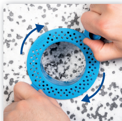
Easy installation Without additional tools