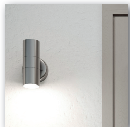
Secure grip thanks to high pull-out forces