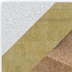
Flexible applications in all common insulation materials